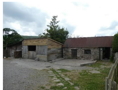
There it is..... exposed at last!