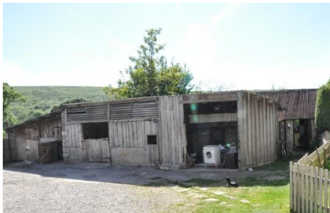
Can you see the office?