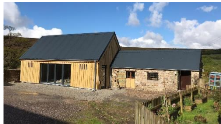
The new Ark facing into the yard