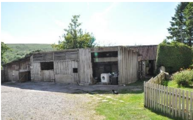
The old barns: pulled down in July 2019 and Jan 2020