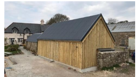
The Ark, facing Corndon