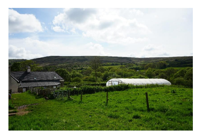
View over the highly productive vegetable plot, May 2024