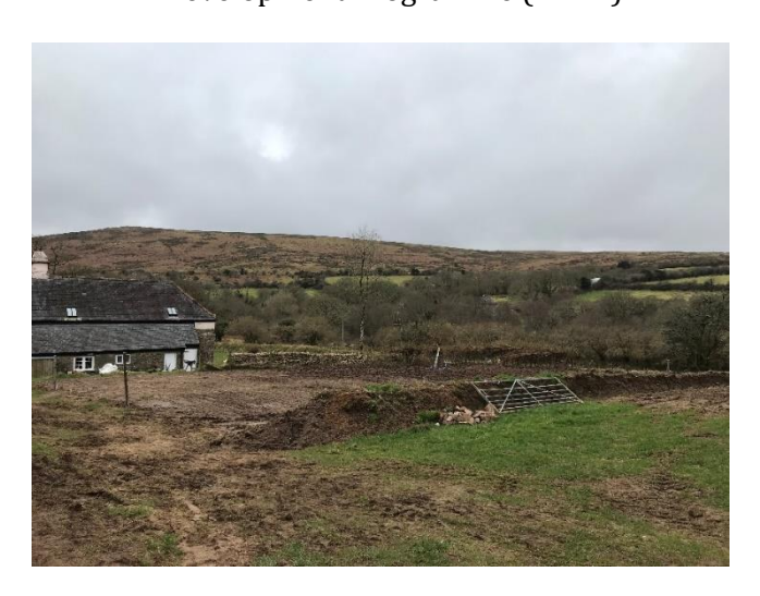
One Acre Field is levelled ready for the poly-tunnel February 2022