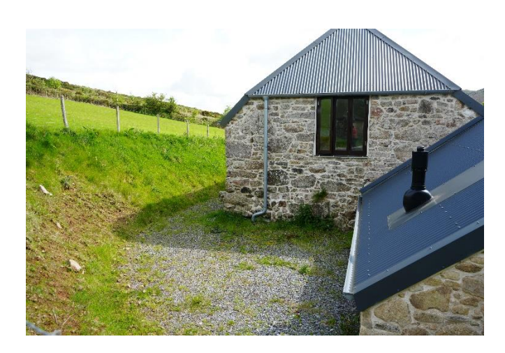
The Converted East Barn with it's 'pig run' and the back of the Plant Room, May 2024