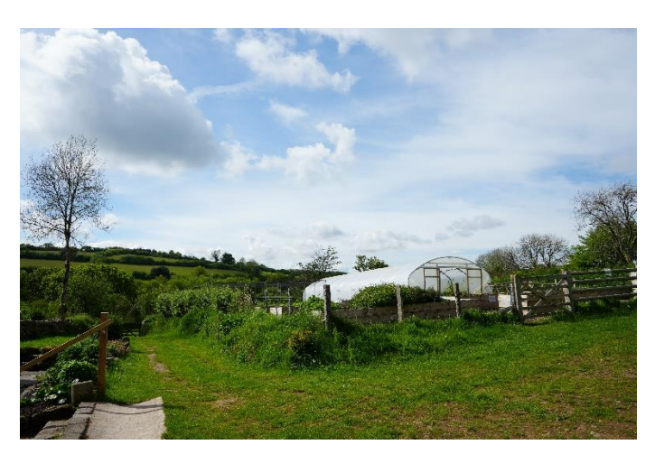
Poly-tunnel, raised beds and fruit cage all in place by May 2022. This photo May 2024.