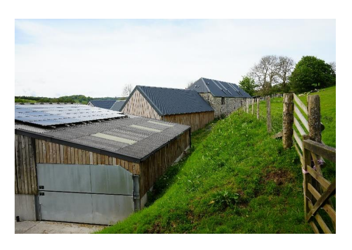
Animal Barn & Lean-to towards the new Corner Barn & House May 2024