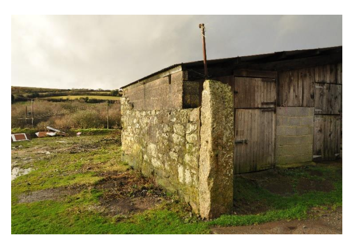
Car Park & curtilage wall January 2020