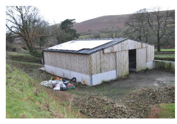
August 2021 and May 2022: the Animal Barn transformed with a lean-to and cemented yard. Note, the Animal Barn was constructed in 2018.