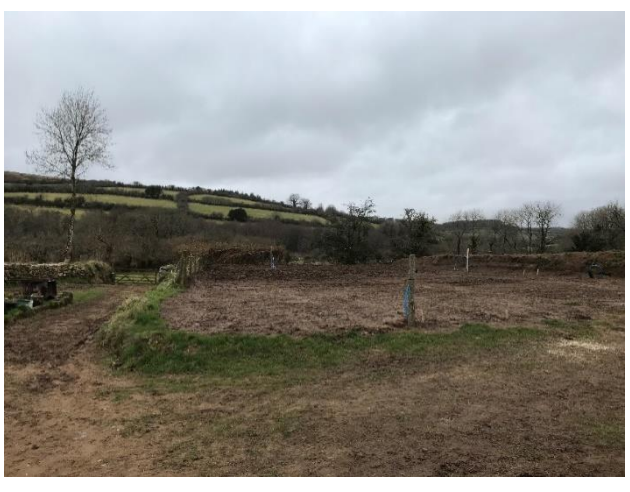
One Acre Field is levelled ready for the polytunnel February 2022. Funded mostly by Rural Development Programme (RDPE).