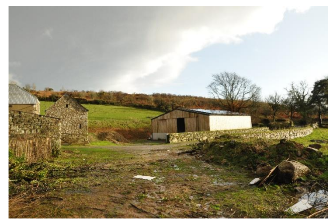
Car park & Farm Yard January 2020