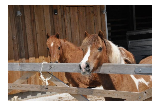
Scrappy and Girlie enjoying the freedom of the yard.