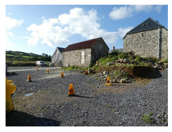
August 2021 open stone yard turned into a covered open and cemented yard May 2022. Corner Barn extension /Animal shed.