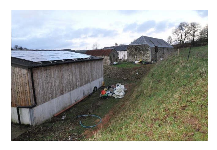
Animal Barn towards the House & Yard January 2020\,