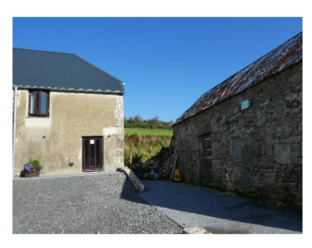
August 2021 and May 2022: No Corner Barn (left) and one constructed (right).