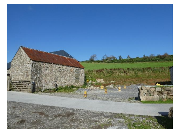
August 2021 to May 2022 Shippen Leanto (disabled toilets and store).