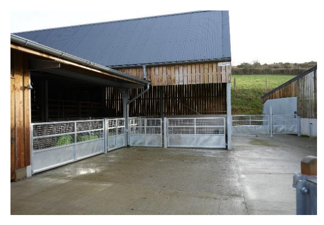
Final completion of the 'child and cow safe' gates in the Farm Yard by December 2023, fabricated and installed by Matt Irish Engineering.